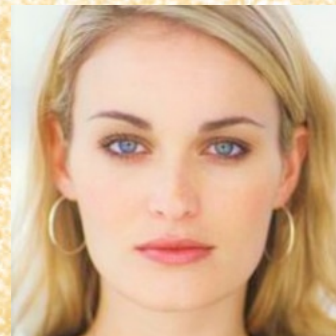
RIA ROMANO PUBLIC RELATIONS